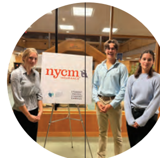
OTSEGO CHRISTIAN ACADEMY