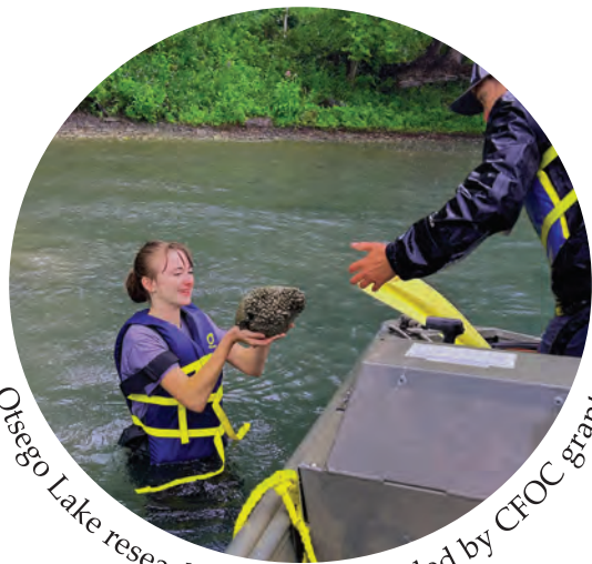
Otsego Lake research is partially funded by CFOC grants

In addition to these grants, CFOC provides awards from its other funds throughout the year, including donor-advised funds.